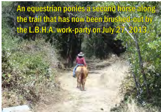
An equestrian ponies a second horse along the trail that has now been brushed-out by the L.B.H.A. work-party on July 27, 2013.