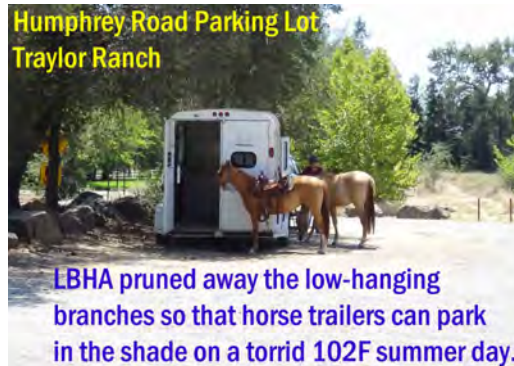
Humphrey Road Parking Lot Traylor Ranch