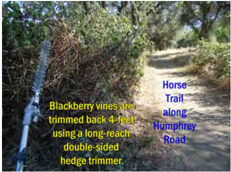
Blackberry vines are trimmed back 4-feet using a long-reach double-sided hedge trimmer.