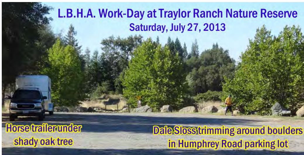
Dale Sloss trims around boulders at Traylor Ranch Saturday, July 27, 2013

The work focused on cutting-back blackberry vines, grooming the horse trails with a Kubota tractor pulling a 6-foot diameter circular mower, clearing overhead branches along trails, and clearing some low-hanging branches in the Humphrey Road parking lot to provide adequate clearance in the shade for horse trailers. The accompanying photographs illustrate the kinds of work performed by the Loomis Basin volunteer work-crew.