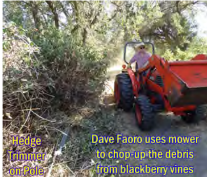
Hedge Trimmer on Pole