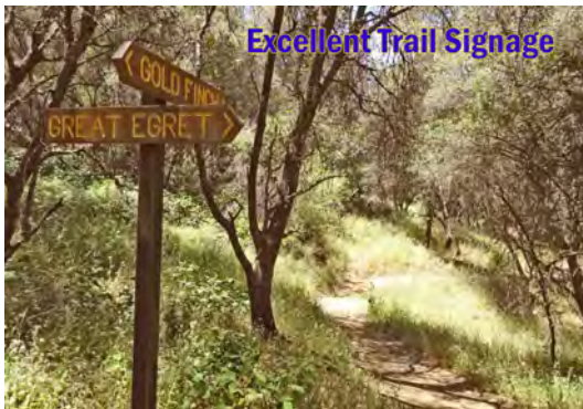
Excellent Trail Signage