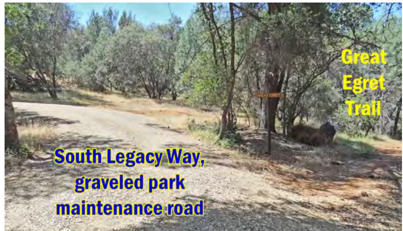
South Legacy Way, graveled park maintenance road