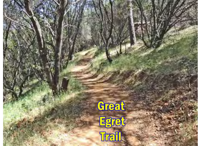
Great Egret Trail