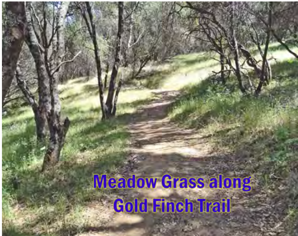
Meadow Grass along Gold Finch Trail