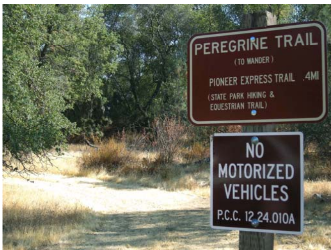
Trail head for the Peregrine Trail