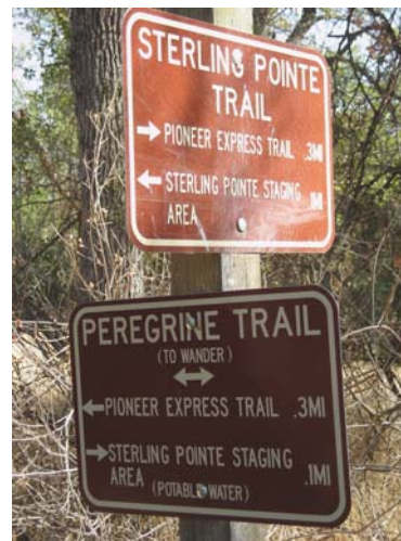
Cross-Over Trail Signs