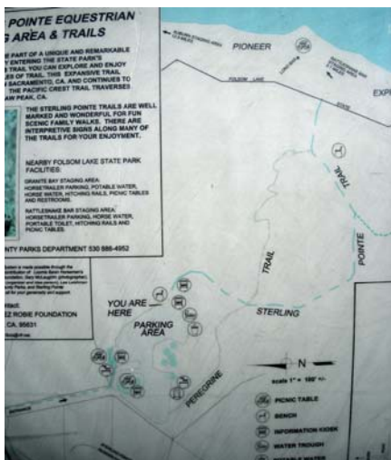
Map of the Peregrine Trail